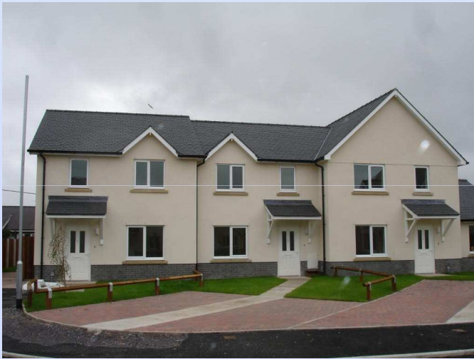
Brynsiencyn – Clwyd Alyn