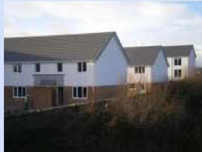
Caergybi – North Wales Housing Association